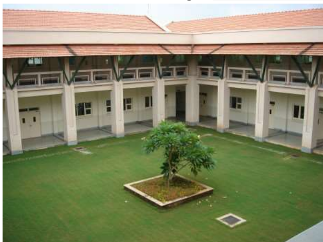
Fig 2. A view from inside the main building