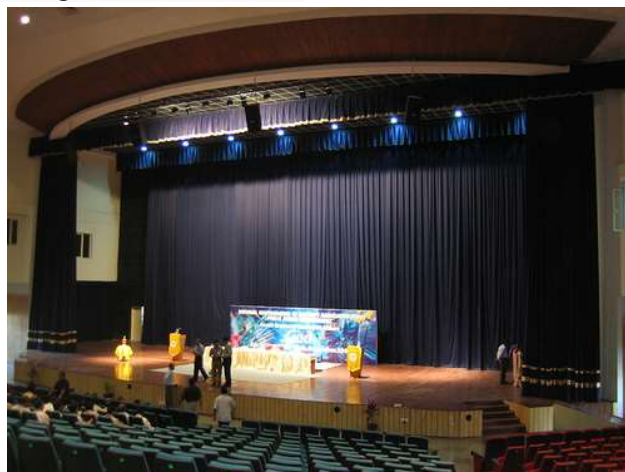
Fig 3. Auditorium, BITS Goa