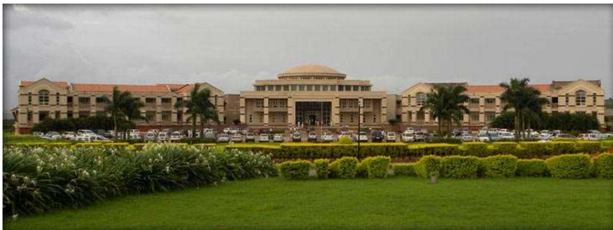
Fig 1. BITS Goa Main Building from Main Lawns